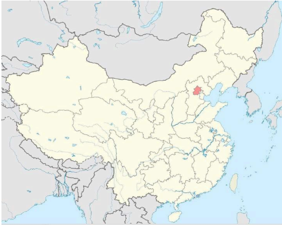
Location of Beijing municipal area